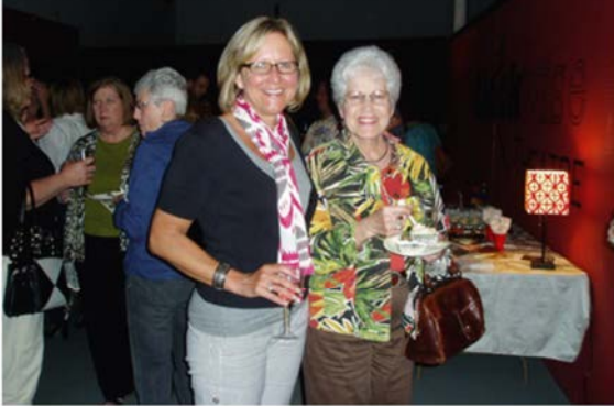
Enjoying a party at Clockwise Theatre

Clockwise Theatre is located at 221 N. Genesee Street in downtown Waukegan. We're easy to find—right next door to the historic Genesee Theatre, just south of Grand Avenue.